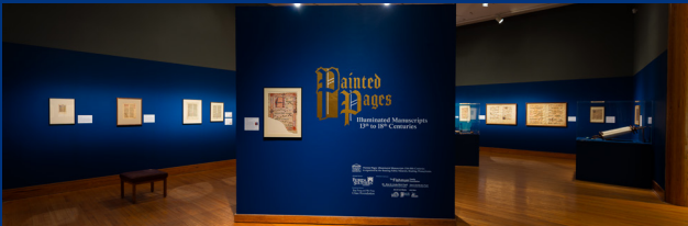
Painted Pages: Illuminated Manuscripts 13th to 18th Centuries installed at the Polk Museum of Art, Lakeland, FL, 2019.