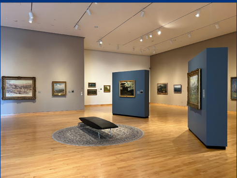
In Nature’s Studio: Two Centuries of American Landscape Painting installed at the Hunter Museum of American Art, Chattanooga, TN, 2023.

As exhibitions retire, new ones are created to take their place. Current favorites include: In Nature’s Studio: Two Centuries of American Landscape Painting , Painted Pages: Illuminated Manuscripts 13 th – 18 th Centuries , Floating Beauty: Women in the Art of Ukiyo-e , and Women Artists: Four Centuries of Creativity . In 2024 and 2025, our touring exhibitions will proudly make appearances at institutions in Pennsylvania, Connecticut, Florida, Maryland, Massachusetts, and North Dakota!