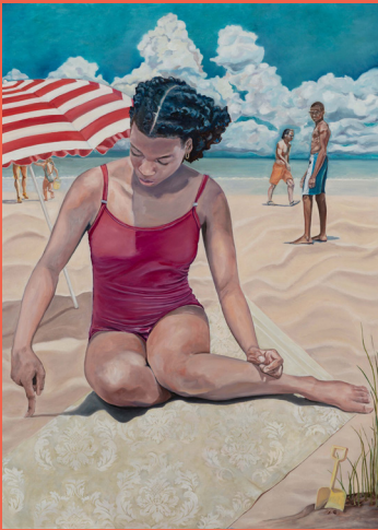
Ayana Ross (American, b.1977), Writing In the Sand , oil on panel, 48x36 inches.

The Reading Public Museum is pleased to present an engaging body of recent work by Atlanta-area contemporary figurative painter Ayana Ross (born 1977). Ross’s subjects are everyday figures, which are inspired by the events in her family’s own history in the American South. The artist captures poignant, sometimes nostalgic, moments that address broader issues of identity, race, family, and memory. Her large-scale compositions often include monumental figures and bold graphic fields of pattern and color. The exhibition at RPM will include more than a dozen of her recent canvases.