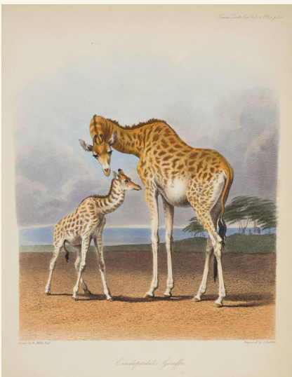
Giraffes, published in Proceedings of the Zoological Society of London by John Gould (1804–1881) and (1820–1899).

The exhibition was inspired by the American Museum of Natural History publication, Natural Histories: Extraordinary Rare Book Selections , which highlights several gems from the American Museum of Natural History Library. It showcases reproductions of illustrations by celebrated artists Albrecht Dürer, Joseph Wolf, Moses Harris, and John Woodhouse Audubon, among others.