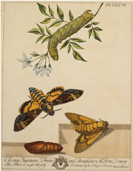
Death's-head moth, published in The Aurelian by Moses Harris (1731?–1785?).

Natural Histories: 400 Years of Scientific Illustration is organized by the American Museum of Natural History, New York (amnh.org).