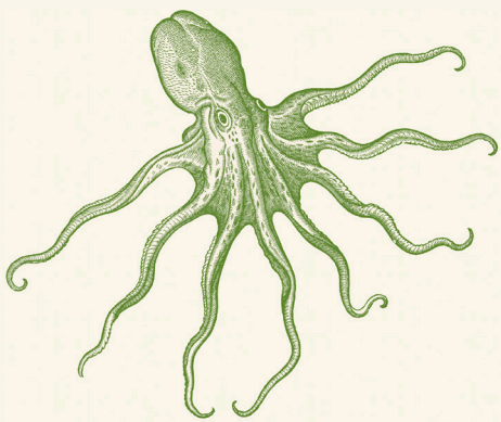
Saucer-eyed cephalopod, published in Historia animalium ( Histories of the animals ) by Conrad Gessner (1516–1565).

Illustration has played an integral role in scientific discovery for centuries. Images were created in pursuit of scientific knowledge and to accompany important scientific works in disciplines ranging from astronomy to zoology. Travel back in time as you explore 40 striking scientific illustrations spanning five centuries and try your hand at scientific illustration in Natural Histories: 400 Years of Scientific Illustration , a new exhibition displayed in The Museum’s World Cultures and Meinig Family Galleries.