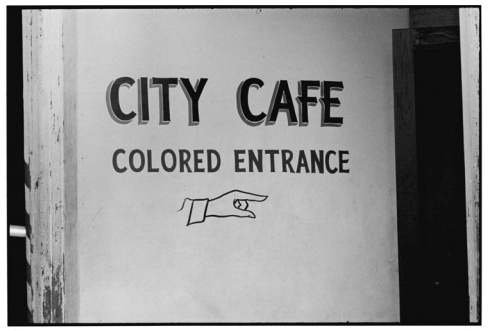
Danny Lyon (American, born 1942), Entrance to the City Café, Selma, 1963 , silver gelatin print.

Exhibition is organized by art2art Circulating Exhibitions.